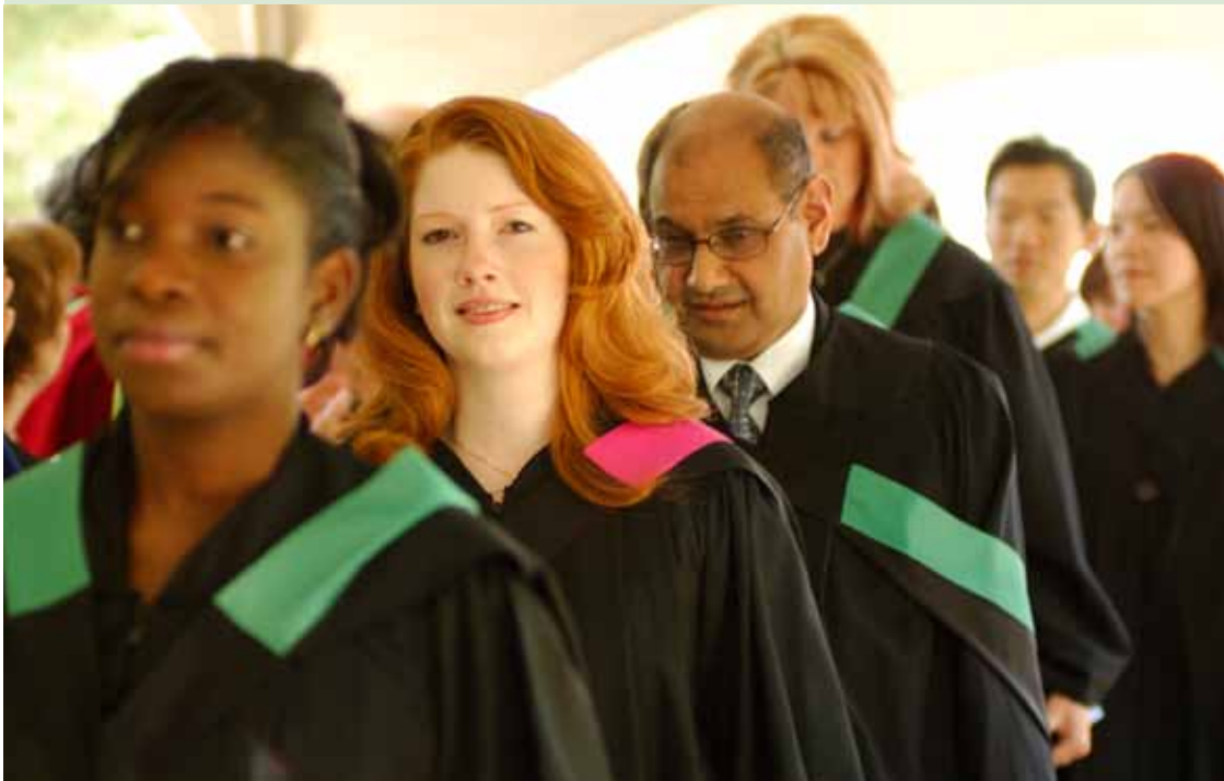
Convocation, Athabasca, AB