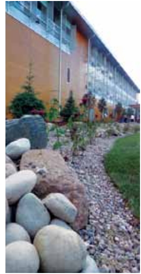
Academic and Research Centre Athabasca, AB

The following statement summarizes the vision for the university as expressed by the AU community during the planning process: Athabasca University is recognized as a best practices university in research, teaching and service and as the leader in removing barriers to post-secondary learning. Based on the research and community consultation described above, five strategic goals have been formulated for realizing this vision during the next five years. Each goal is described below and followed by a list of associated strategic objectives (high-level objectives that will contribute to the achievement of the goal) and measurable key outcomes. Monitoring of these outcomes over the term of this strategic plan will ensure that progress is clear to all stakeholders and that AU can adjust to new challenges and opportunities that may arise during the planning period.