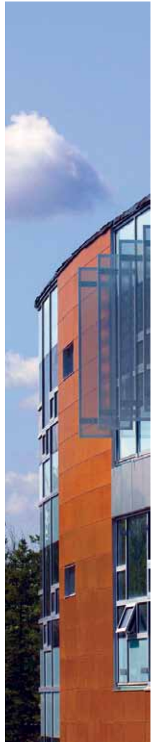
Academic and Research Centre Athabasca, AB