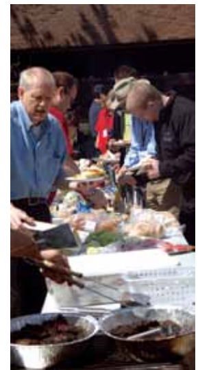
AU staff barbeque Athabasca, AB