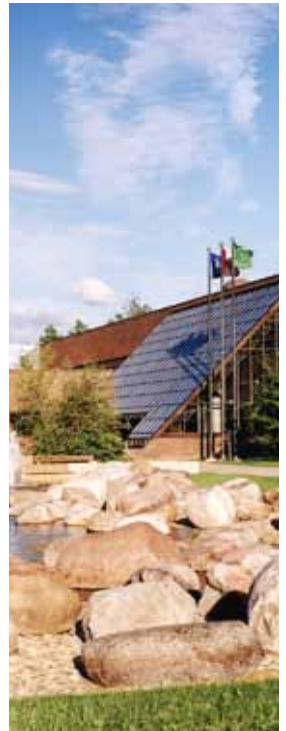
Athabasca University main campus Athabasca, AB